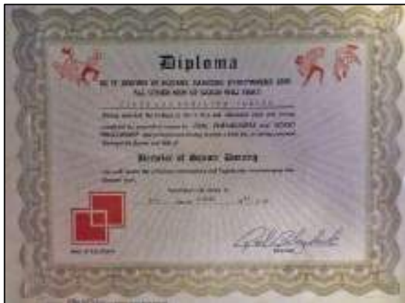
Jimmy & Rosalynn's Square Dance Diploma.

Born in Plains, Georgia, and a graduate of the U.S. Naval Academy at Annapolis, Jimmy served seven years in the U.S. Navy. During his military service he married Rosalynn, also a native of Plains, Georgia. In 1953, after completing his military service, Jimmy returned home to manage the family's peanut warehouse business.