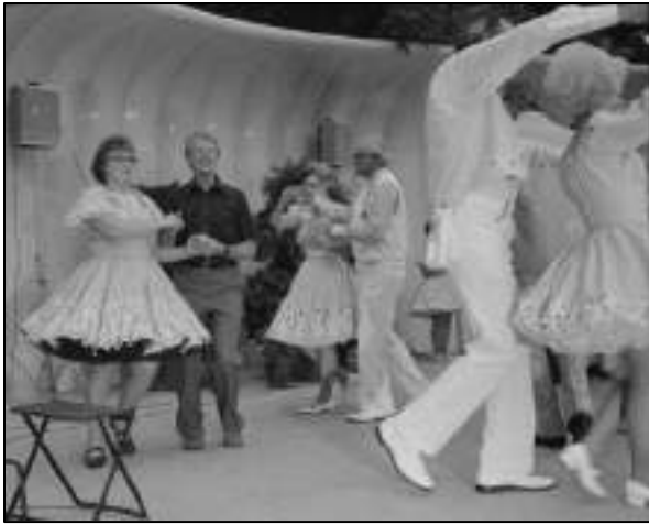
President Carter square dancing at Congressional Picnic, July 1977.

The Carters continued to host square dances in the White House, including hosting dances on the South Lawn of the White House for several events, such as Congressional Picnics.