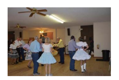
Great time had by all!